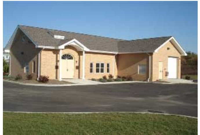
Plant No. 20

The Water District is planning for the future with its acquisition of a 4-acre parcel on Old South Path.