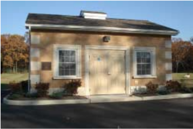
Plant No. 19-2