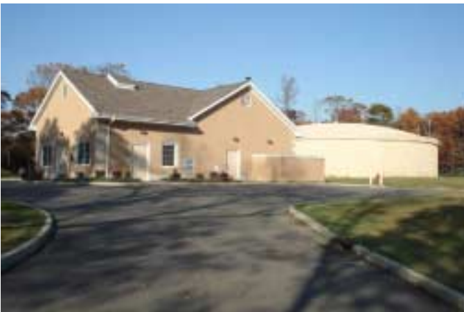
Plant No. 19-1 with ground storage tank in background

This plant also has a ground storage tank with a capacity of 1.5 million gallons. The addition of the second well during 2005 brings to completion a major capital program on the District's beautiful 6-acre site.