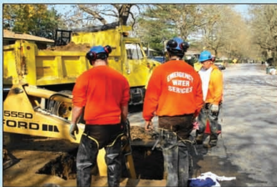
SHWD crew performs repairs on distribution system.